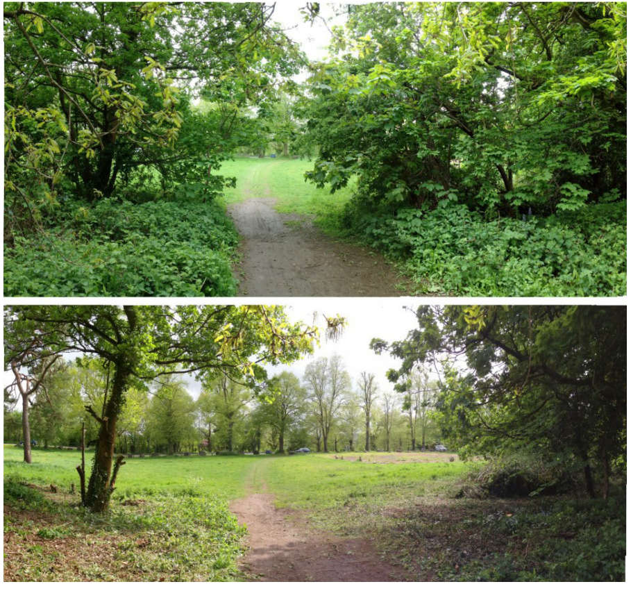
Above: Before and after views from the Circle, looking out across the ha-ha and tennis courts we cleared earlier in the year, towards the avenue along Shirehampton Road.

the slopes below the Eighteenth Century viewing Terrace.